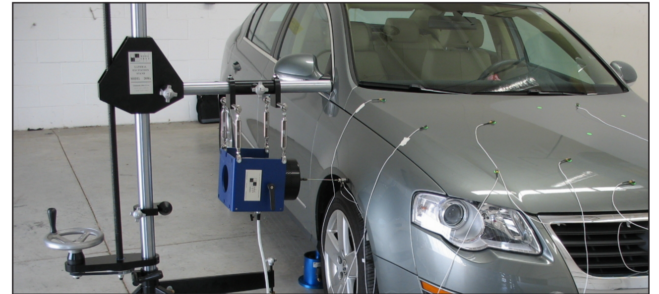
MD-0348 revA 1021