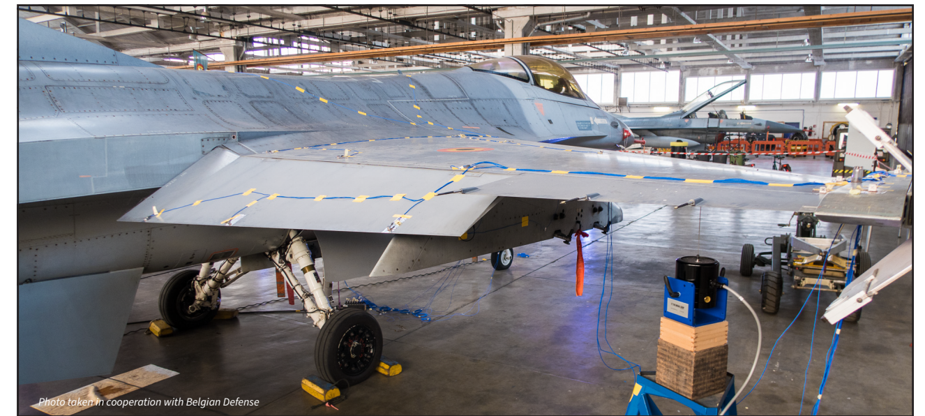
MD-0316 revB 0619