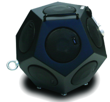
BAS001 Omnidirectional Source