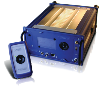
BAS002U/E Lightweight Power Amplifier