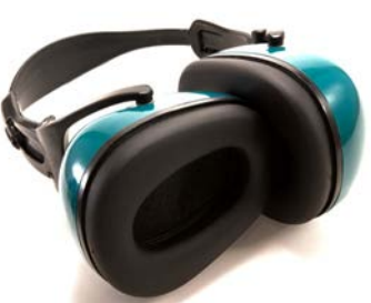
Test Lab Applications