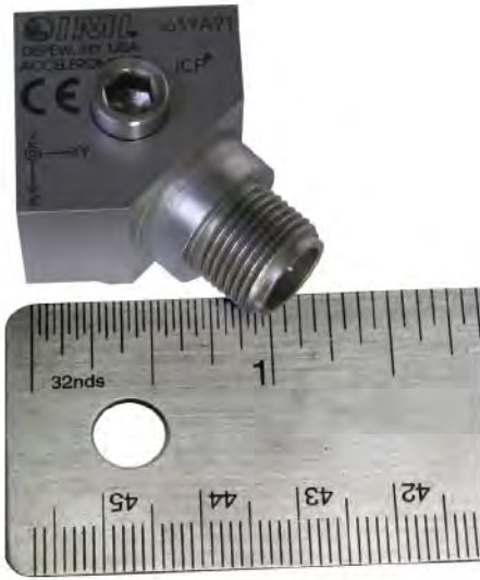
Figure 3: A triaxial accelerometer with a footprint less than one inch square and a 13kHz frequency response on all three axes

tor. Rather, it is determined by the housing material, the level of seal the housing provides and the electrical isolation of the housing. Most industrial accelerometer housings are 304 or 316 stainless steel and hermetically sealed in order to withstand chemical exposure and wide operating temperature ranges. An isolated case housing allows an accelerometer to be mounted on equipment with poor electrical grounding without running the risk of signal contamination. This isolation is typically achieved with the use of a Faraday cage, a continuous enclosure around the sensor's electronics to repel noise.