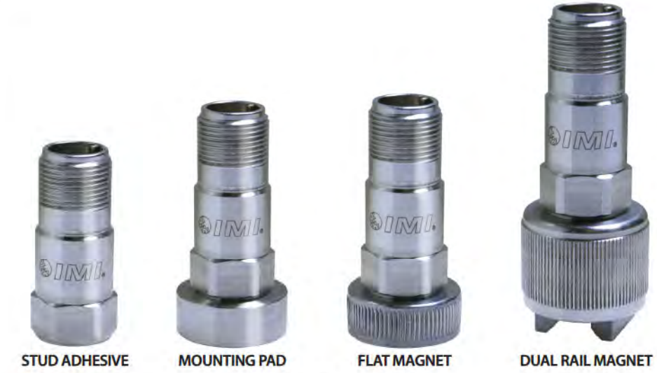
Figure 2: Four common mounting methodologies for accelerometers