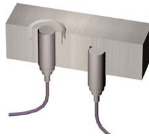
Figure 11: Strain Isolated Pressure Transducer Left – Isolated “Check” Transducer Right