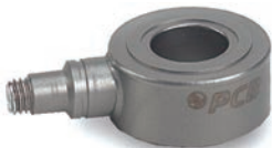
ICP® QUARTZ FORCE RING MODEL 202B

Sensitivity: 5 mV/lb & 1 mV/lb Measurement Range: 1000 lb & 5000 lb Low Frequency Response: 0.001 Hz & 0.0003 Hz (-5 %) Maximum Static Force: 6000 lb & 8000 lb