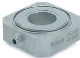
TRIAxIAL ICP® FORCE SENSOR MODEL 260A03

Sensitivity: 2.5 mV/lb Measurement Range: 1000 lb Low Frequency Response: 0.01 Hz (-5 %) Upper Frequency Limit: 90 kHz