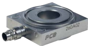
TRIAxIAL ICP® FORCE SENSOR MODEL 260A01 & 260A02

ICP® force sensors incorporate a built-in MOSFET microelectronic amplifier. This serves to convert the high impedance charge output into a low impedance voltage signal for analysis or recording. Quartz, piezoelectric force rings from PCB® output a high integrity signal under compressive force in cyclical loading applications. Force rings possess extreme stiffness and accuracy, making them ideal for measuring microsecond duration events common to metal forming equipment (crimp, bend, stake, or stamp), drop test, and product testing applications.