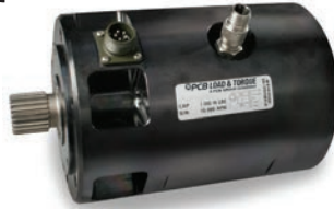
Series 4115A & 4115K