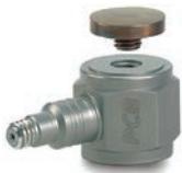
ICP® FORCE SENSOR MODEL 208C03

Measurement Range: 5,000 in-lb (565 Nm) Maximum Speed: 15,000 RPM 16 Bit Telemetry