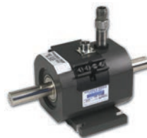
ROTARY TORQUE SENSOR MODEL 3125-01A

Measurement Range: 500 lb (2.224 kN) Compression/Tension Height: 0.625 in (15.88 mm) Low Frequency Response: (-5%) 0.0003 Hz