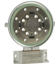
TORKDISC® TELEMETRY SYSTEM MODEL 5302D-02A

Measurement Range: 500 lb (2224 N) Size: Height: 3.0 in (76.2 mm) 10 ft - Integrated Cable