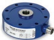
GENERAL PURPOSE LOW PROFILE LOAD CELL SERIES 1200

Measurement Range: 20,000 lbf-in (2,259 Nm) 50% static overload protection 5 in (127 mm) diameter steel flange