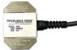
S-TYPE LOAD CELL MODEL 1631-01C

Measurement Range: 20 k lb (89 kN) Sensitivity: 2.00 mV/V 50% static overload protection