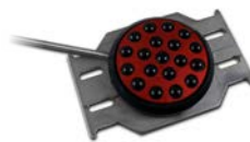
PEDAL FORCE TRANSDUCER MODEL 1515-110-03A

Measurement Range: 500 to 50k lbf (2200 to 220k N) English and Metric sizes PT and PC connector styles