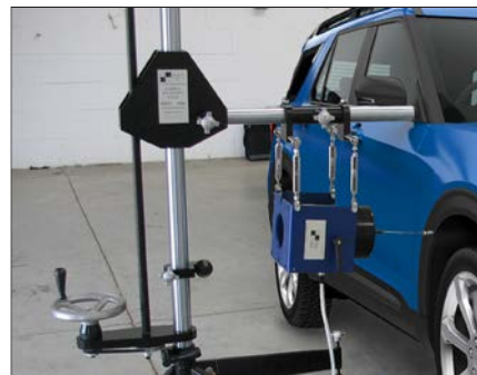
MD-0348 revA 0324