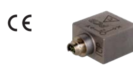
UHT-12™, ICP® TRIAXIAL ACCELEROMETER MODEL 339B32

Sensitivity: \pm 500 g pk Measurement Range: 10 mV/g Frequency Range ( \pm 5\% ): 2 to 8k Hz