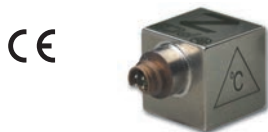
UHT-12™, ICP® TRIAXIAL ACCELEROMETER MODEL 339A30

Sensitivity: \pm 5000 g pk Measurement Range: 1 mV/g Frequency Range ( \pm 5\% ): 1 to 5k Hz