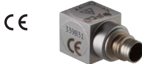
UHT-12™, ICP® TRIAXIAL ACCELEROMETER MODEL 339B31

Sensitivity: \pm 500 g pk Measurement Range: 10 mV/g Frequency Range ( \pm 5\% ): 2 to 8k Hz