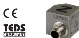
UHT-12™, ICP® TRIAXIAL ACCELEROMETER MODEL TLD339A36

Sensitivity: \pm 100 g pk Measurement Range: 50 mV/g Frequency Range ( \pm 5\% ): 2 to 5k Hz