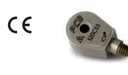
ICP® ACCELEROMETER MODEL 320C53

Sensitivity: \pm 500 g pk Measurement Range: 10 mV/g Frequency Range ( \pm 5\% ): 1 to 10k Hz