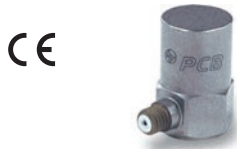
ICP® ACCELEROMETER MODEL 320C03

High and low temperature extremes and thermal transients can play havoc with the quality of your data. Piezoelectric crystals are required for accurate and efficient dynamic measurements at temperature extremes, and during fast thermal gradients often exhibit undesired spiking phenomena. PCB® has developed a family of accelerometers employing new crystal designs and processes pioneered at PCB®, to minimize and eliminate this effect.