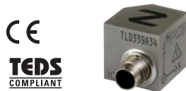
UHT-12™, ICP® TRIAXIAL ACCELEROMETER MODEL TLD339A34

Sensitivity: \pm 500 g pk Measurement Range: 10 mV/g Frequency Range ( \pm 5\% ): 2 to 10k Hz