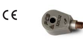
ICP® ACCELEROMETER MODEL 320C52

Sensitivity: \pm 500 g pk Measurement Range: 10 mV/g Frequency Range ( \pm 5\% ): 1 to 6k Hz