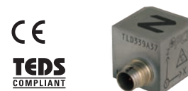
UHT-12™, ICP® TRIAXIAL ACCELEROMETER MODEL TLD339A37

Sensitivity: \pm 500 g pk Measurement Range: 10 mV/g Frequency Range ( \pm 5\% ): 2 to 5k Hz