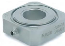
TRIAxIAL ICP® FORCE SENSOR MODEL 260A03