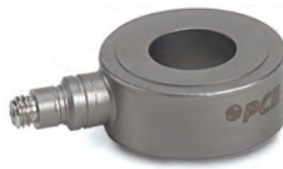
ICP® QUARTZ FORCE RING MODEL 203B