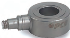
ICP® QUARTZ FORCE RING MODEL 202B