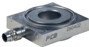
TRIAxIAL ICP® FORCE SENSOR MODEL 260A01 & 260A02

ICP® force sensors incorporate a built-in MOSFET microelectronic amplifier. This serves to convert the high impedance charge output into a low impedance voltage signal for analysis or recording. Quartz, piezoelectric force rings from PCB® output a high integrity signal under compressive force in cyclical loading applications. Force rings possess extreme stiffness and accuracy, making them ideal for measuring microsecond duration events common to metal forming equipment (crimp, bend, stake, or stamp), drop test, and product testing applications.