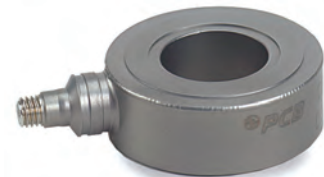
ICP® QUARTZ FORCE RING MODEL 204C