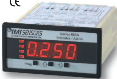
Series 683A Indicator/Alarm displays machinery vibration levels and offers alarm set points to indicate deteriorating machinery condition

Model 683A indicator/alarm is specifically designed for continuous vibration monitoring requirements with ICP® or 4-20 mA industrial vibration sensors. The unit operates from universal AC or DC power, provides 24 VDC sensor excitation, and can retransmit a 4-20 mA signal for remote monitoring or recording. Two, user-programmable set points activate individual, 5 amp, Form-A relay contacts to provide early warning of deteriorating machinery conditions. An adjustable time delay for each set point eliminates potential for false alarm trips due to ambient, short duration vibratory upsets. The unit installs into a standard, 1/8 DIN, panel cutout and is available with an optional NEMA 4X front cover.