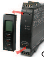
Model 682A06 & Model 682A16 (shown with optional programmable display Model 070A80)