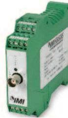
Model 682A05 (US Patent Number 6,889,553)