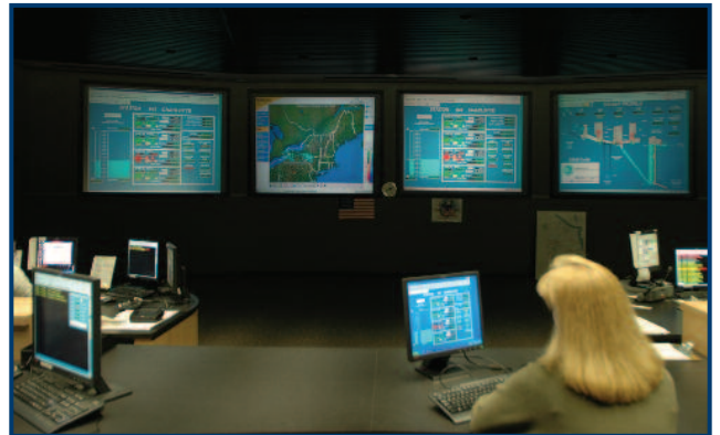
Vibration levels are monitored at the control room