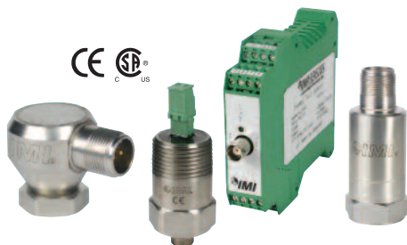
Continuous Vibration Monitoring Equipment

These products are backed up with IMI Sensors' industry leading Lifetime Warranty+, and Best Price Guarantee. IMI has 24-hour customer service, and our promise of Total Customer Satisfaction.