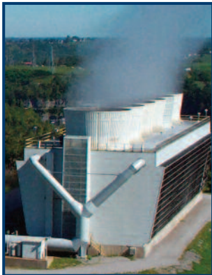
Vibration transmitters monitor cooling towers

Displacement is the preferred measure for low frequency and balance measurements. It is often difficult to make good acceleration and even velocity measurements below 10 Hz (600 cpm). The 653A01 measures accurately down to 1.5 Hz (90 cpm) making it a very effective sensor for monitoring slow speed machinery. Since it is housed in a hermetically sealed stainless housing, it is an excellent choice for use in harsh and corrosive environments like cooling towers. The unit has a range of 40 mils p-p and a frequency range of 1.5 to 300 Hz (90 to 18,000 cpm). It is a 2-wire, loop-powered device and is fully compatible with most plant monitoring systems.