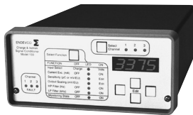
Model 133 3-channel signal conditioner